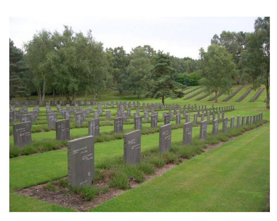
Cannock Chase German Military Cemetery