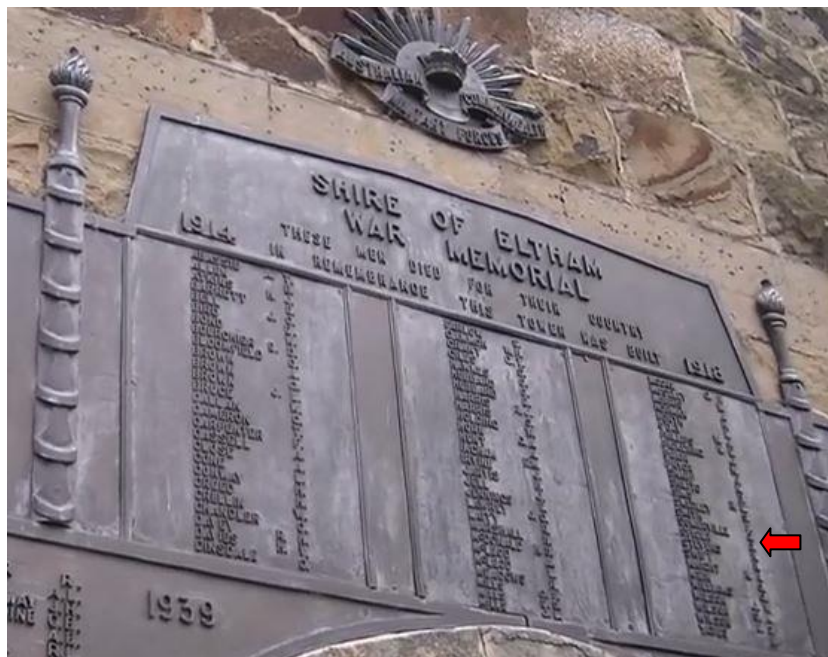
Eltham Memorial Tower