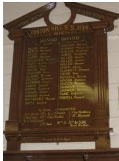
Panton Primary School Honour Board