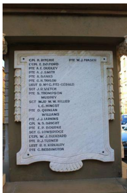
Newcastle World War 1 Memorial