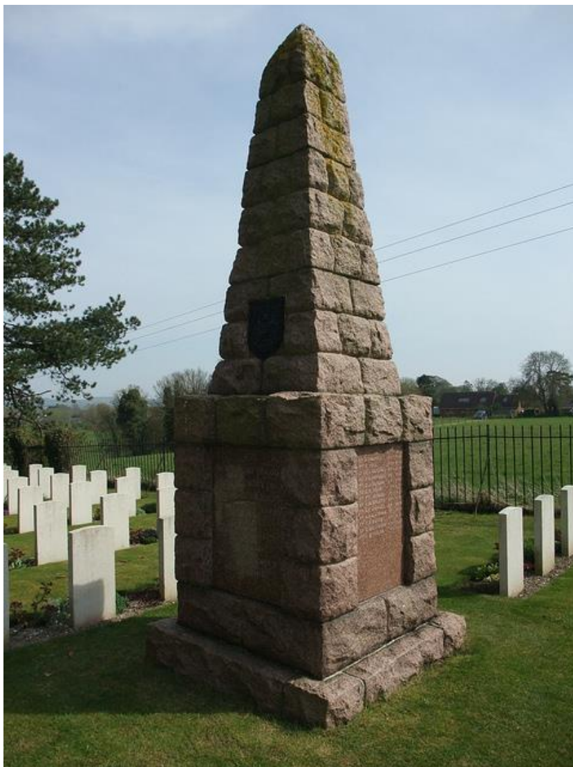
Memorial to 1 st Training Battalion A.I.F. at Durrington Cemetery