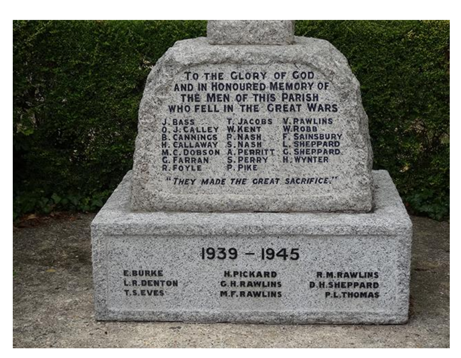
Figheldean War Memorial