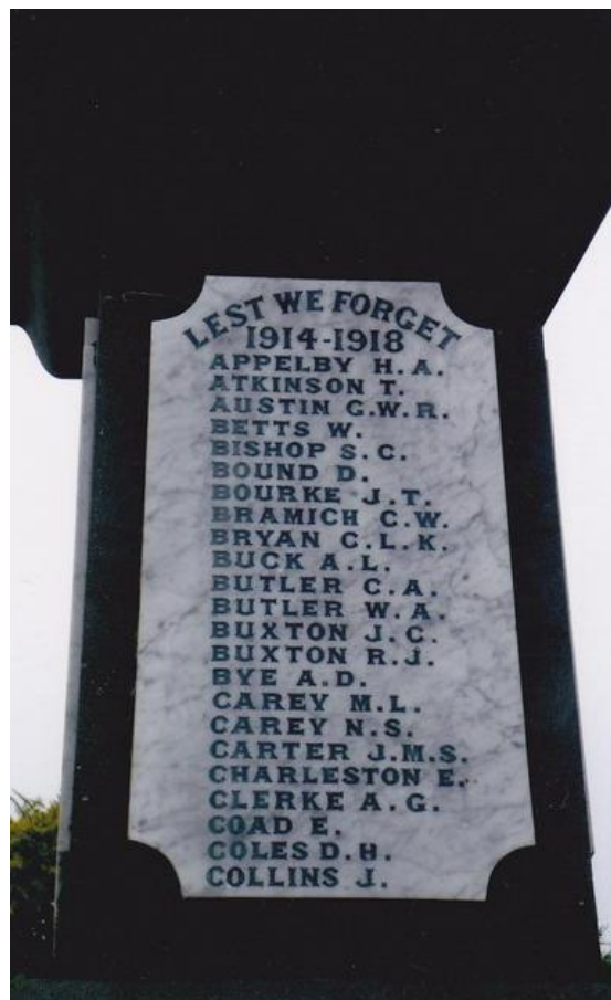
Sheffield War Memorial