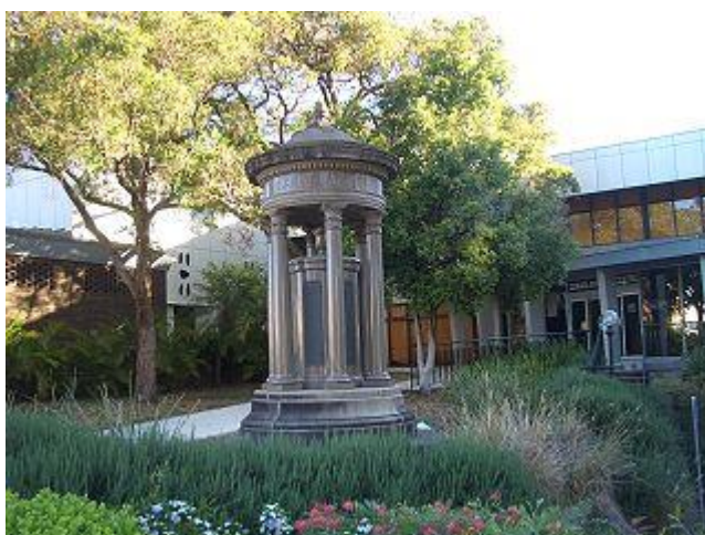
Drummoyne War Memorial