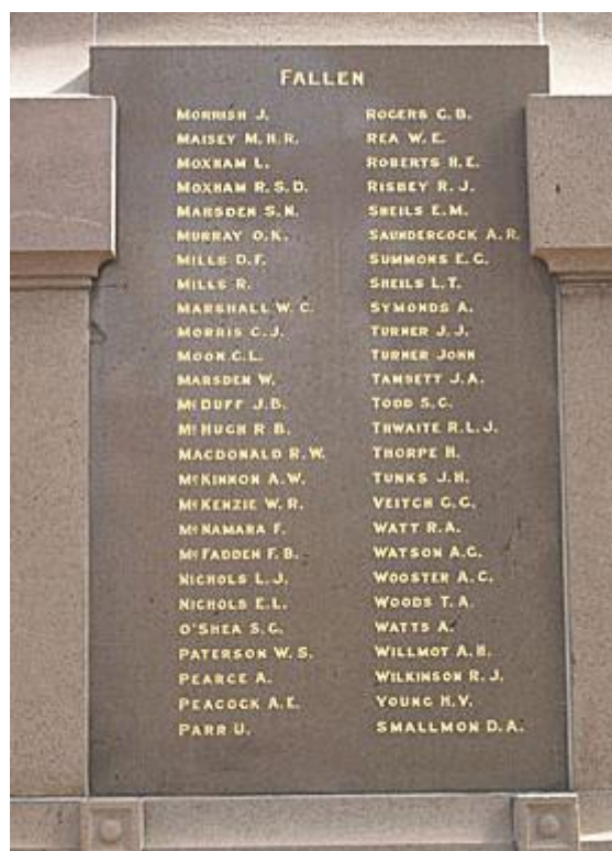
Parramatta War Memorial