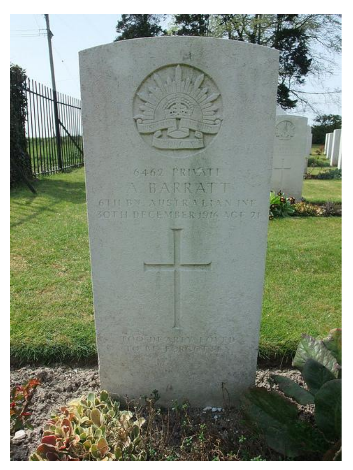
Photo of Pte A. Barratt's Headstone at Durrington War Graves Cemetery, Wiltshire.