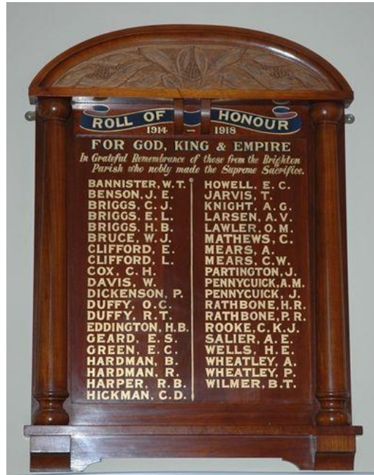
St. Mark's Roll of Honour