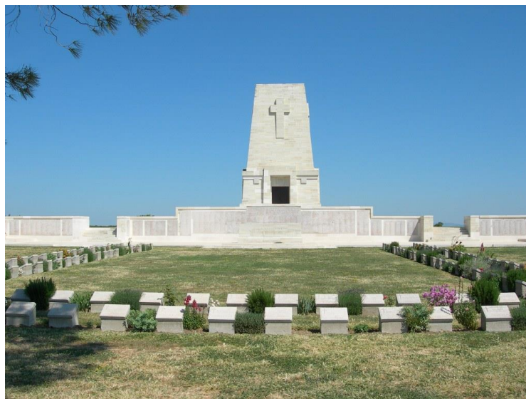
Lone Pine Cemetery & Memorial