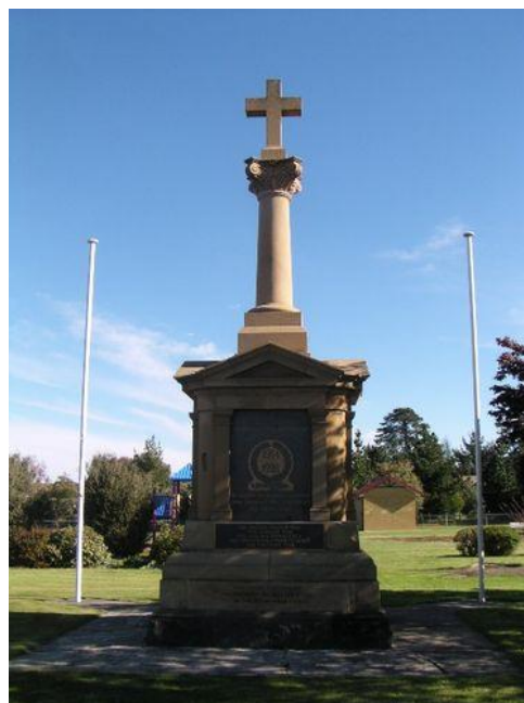
Municipality of Brighton War Memorial