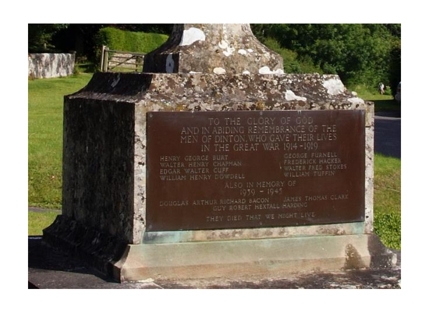
They Died That We Might Live