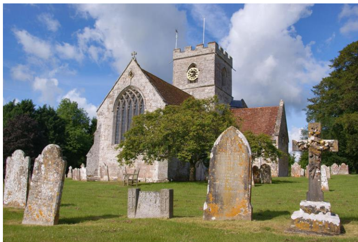
St Mary's Church, Dinton

A photo of Private Cuff's headstone can be purchased from The War Graves Photographic Project .