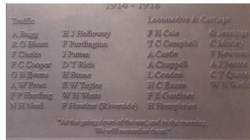
The GWR Memorial Panels at Cardiff Central Station