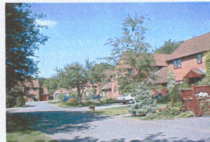
West Farm Close.

The population of the village has increased over the last fifty years, this increase has been accommodated in nine major developments which increased the housing stock by nearly 150.