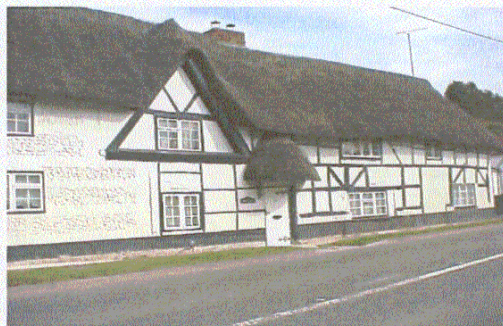
19 and 21 Ludgershall Road

Thatch roofing is still widespread. Before the War long straw thatch was typical. It has a shaggy surface and is fixed with straps at the eaves. Long straw flows easily round half hipped roofs and eyebrow windows and probably contributed to these forms. A flush wrap over ridge is traditional. New forms of thatch have recently been introduced which has a more compact appearance. Very little slate is in evidence, which was unpopular in Wiltshire before the advent of the canals, which brought slate from Wales. Plain red tiles are found in some older properties and have been used in some recent buildings as they mellow well within the village environment. Several modern properties use the less costly concrete tiles.