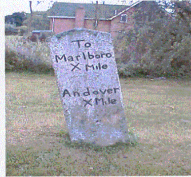
Listed Mile Stone.

The rural Character of the village is eroded by the busy main highway dividing it into two main sections, east and west. Much of its atmosphere will return if the promised by-pass is provided. Consequently there is a proliferation of modern signs for both directions and vehicle speed control, and this variety of street furniture, including overhead cables for telephone and some electric supplies does detract somewhat from the surroundings which include the winter bourne.