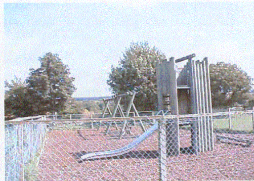
Children's Play Ground.