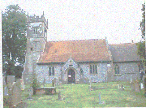
St Andrews Parish Church.

Although there is evidence of a settlement at Collingbourne Ducis for well over a millennium it is in the 17th Century that building methods and materials began to shape the village scene, with known dates suggesting Linden Cottage of circa 1694 as one of the oldest.