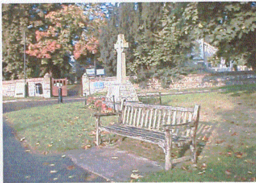
War Memorial and seat.

Modern housing developments have generally, fences and hedging and more recently “open plan” landscaping but finger posts and mile stones are retained in their ancient tradition, as is the War Memorial. Play grounds are there for the children to dissipate their energies, whilst benches are provided for the walker to rest and ponder awhile.