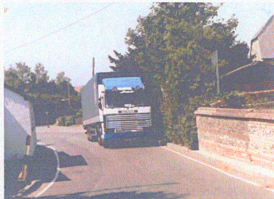
Lorry approaching Church corner.

Villagers have learned to be dependent on the motor car and two car households are not uncommon. Visits to doctors surgeries for those without transport are usually met by friends or volunteers in the village.