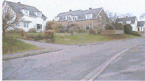
Bourne Rise. ( Mid 1970's)

Thatch roofing is still widespread. Before the War long straw thatch was typical. It has a shaggy surface and is fixed with straps at the eaves. Long straw flows easily round half hipped roofs and eyebrow windows and probably contributed to these forms. A flush wrap over ridge is traditional. New forms of thatch have recently been introduced which has a more compact appearance. Very little slate is in evidence, which was unpopular in Wiltshire before the advent of the canals, which brought slate from Wales. Plain red tiles are found in some older properties and have been used in some recent buildings as they mellow well within the village environment. Several modern properties use the less costly concrete tiles.