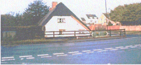
Farthings (Late 17th Century).

Materials used in the construction of the older buildings consist of mainly local brick, often speckled red, and rubble and flints was used to build walls. These walls were often covered in lime wash and some modern developments were required, as a planning requirement to white paint their walls to harmonise with the older properties nearby.