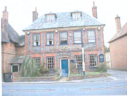
Blue Lion Inn.

Commercial activity within the village is now extremely varied both in size and scope, concentrated on two small business estates. There are the more traditional village enterprises, The Shop, which is also the Post Office, and two inns, a large racing stable (the largest employer), a long established road haulage company and a number of small service businesses. In total there are over thirty concerns now operating within the village, an impressive number given the overall size of the parish.