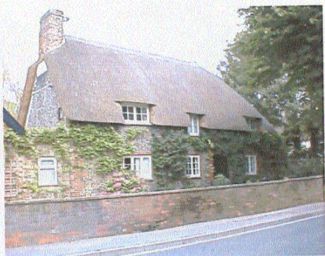
Linden Cottage circa 1694.