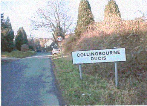
Collinbourne Ducis sign Cadley.