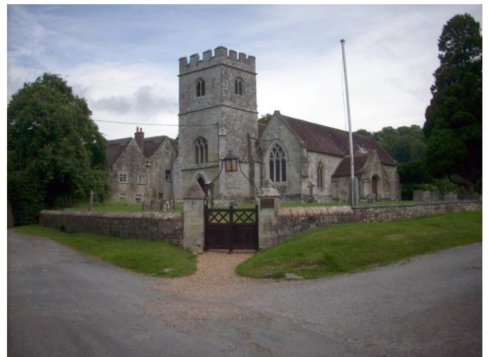
St. Mary's Church, Codford