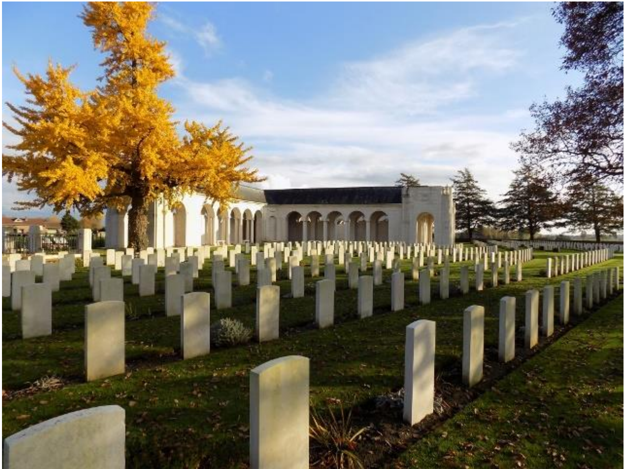
Le Touret Memorial, Pas De Calais, France