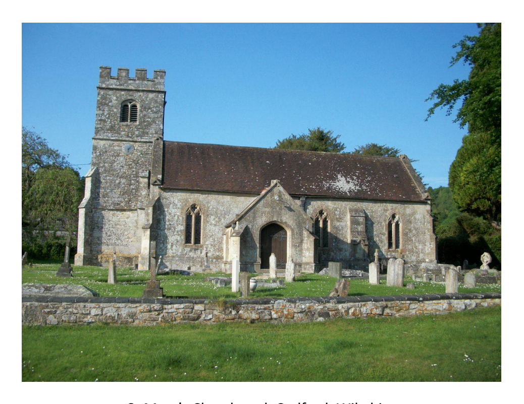
St Mary's Churchyard, Codford, Wiltshire