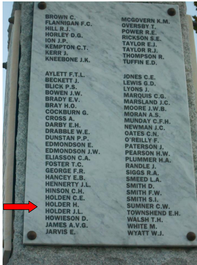
West Leederville War Memorial with new back panel