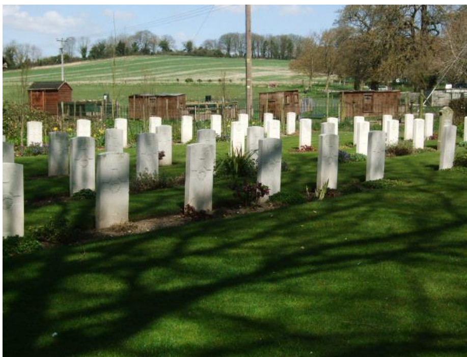
Anzac Cemetery, Codford (Photo courtesy of Romy Wyeth 2013)

Outcome – Pte Holder has the Christian Cross on his CWGC Headstone.