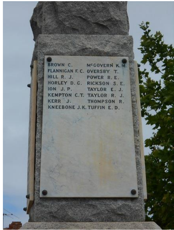
West Leederville War Memorial & the existing back panel where the additional 50 names will be added.