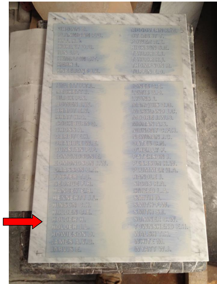
The work in progress by Perth Monumental Works – a mock up of how the names will fit on the back panel