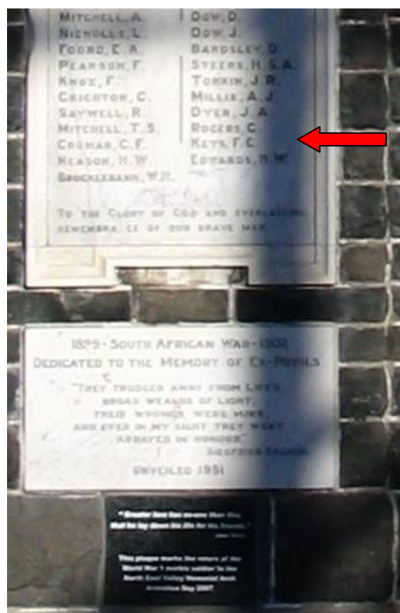
North East Valley School War Memorial Archway