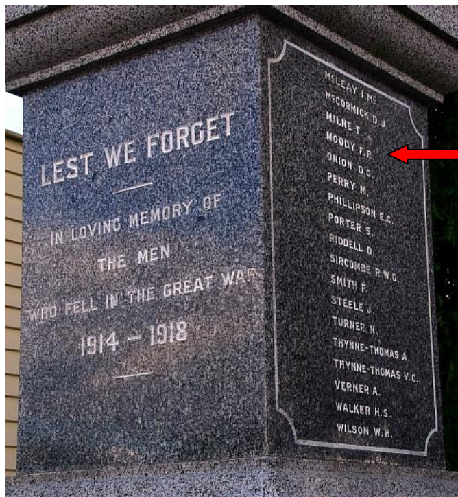
Kihikihi First World War Memorial