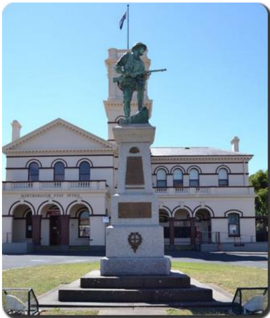
Maryborough War Memorial