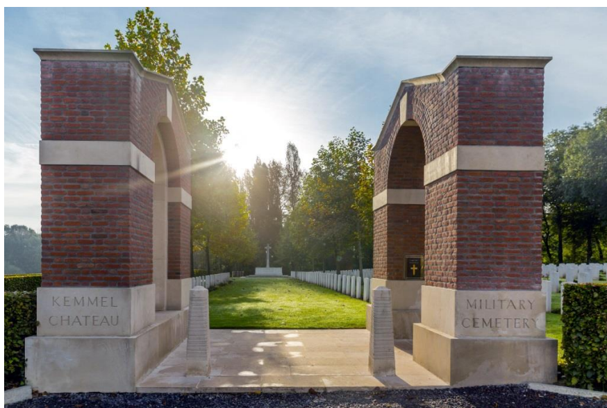
Kemmel Chateau Military Cemetery