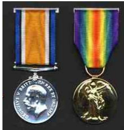
British War Medal & Victory Medal