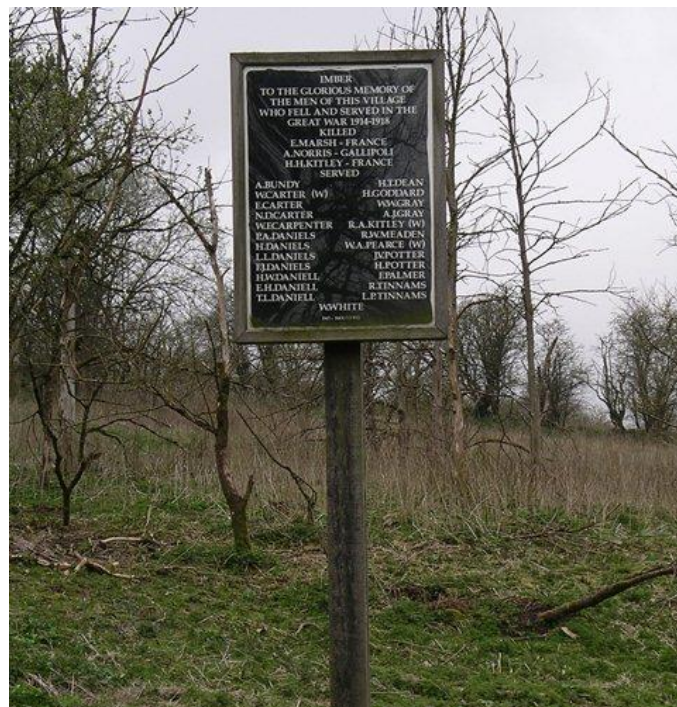
Imber War Memorial Plaque (1920)