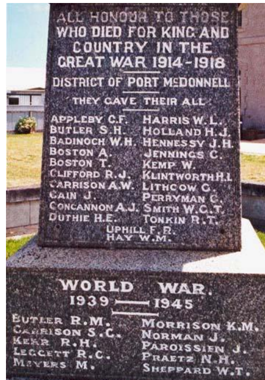
Port MacDonnell War Memorial