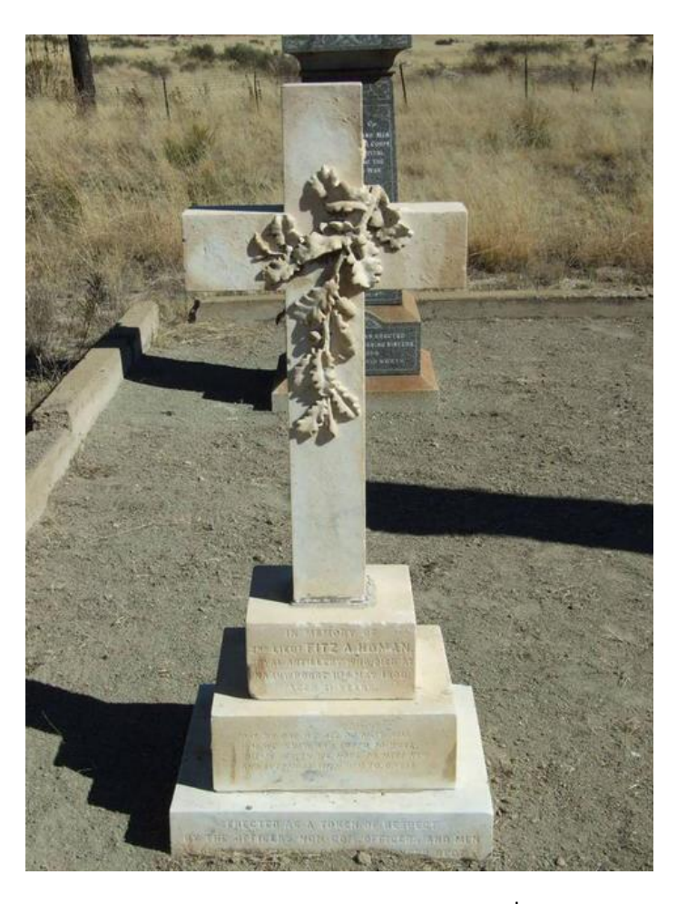
Headstone of 2<sup>nd</sup> Lieut. Arthur Charles Fitzgerald Homan