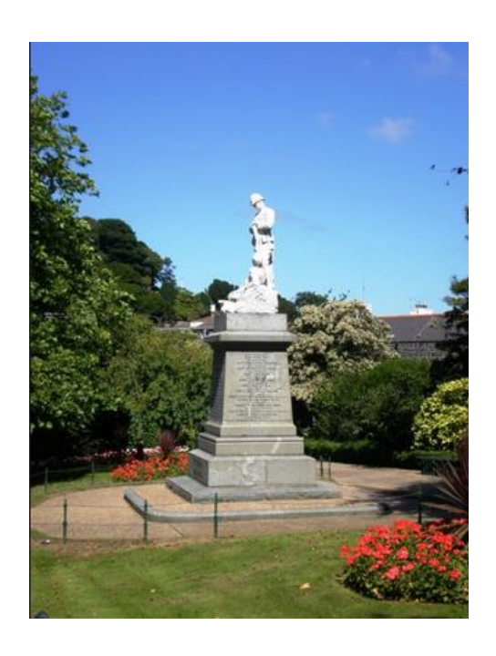
St. Peter Port Boer War Memorial