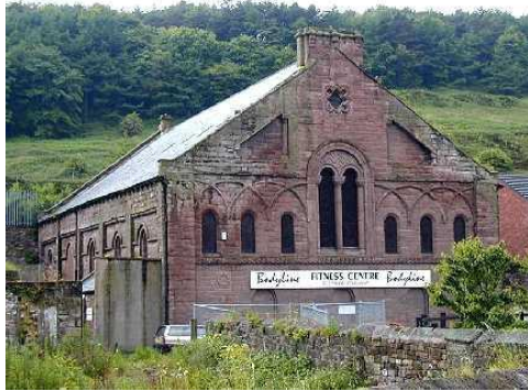
← The church of Christchurch closed as a place of worship