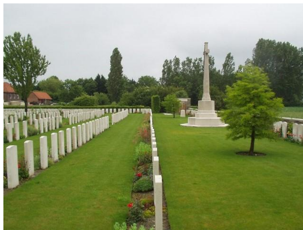
Pont du Hem Military Cemetery