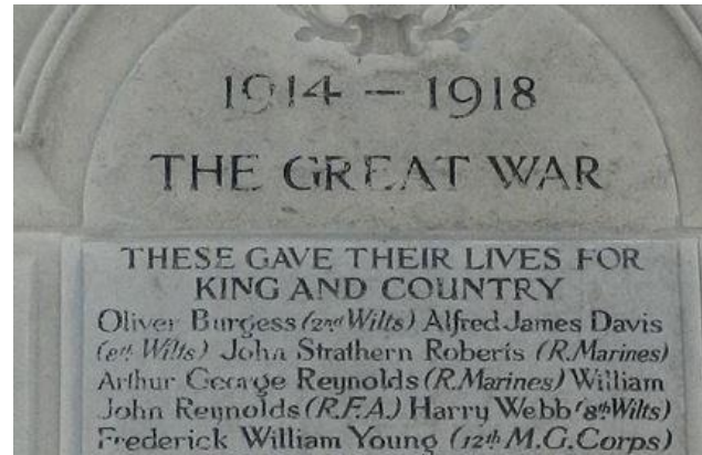
← All Saints Roll of Honour Plaque, Great Chalfield