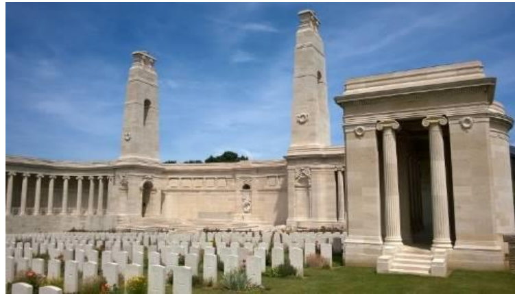
Vis-en-Artois Memorial, Pas-de-Calais, France