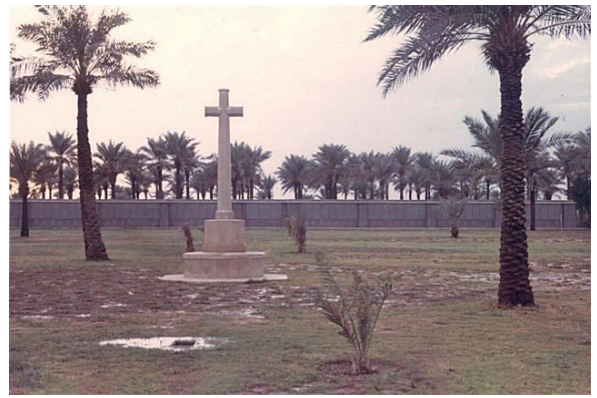
Amara War Cemetery, Iraq

(April 24th—April 30th, 1915.) For Church Expenses 4 18 0 Sick and Poor 1 14 11