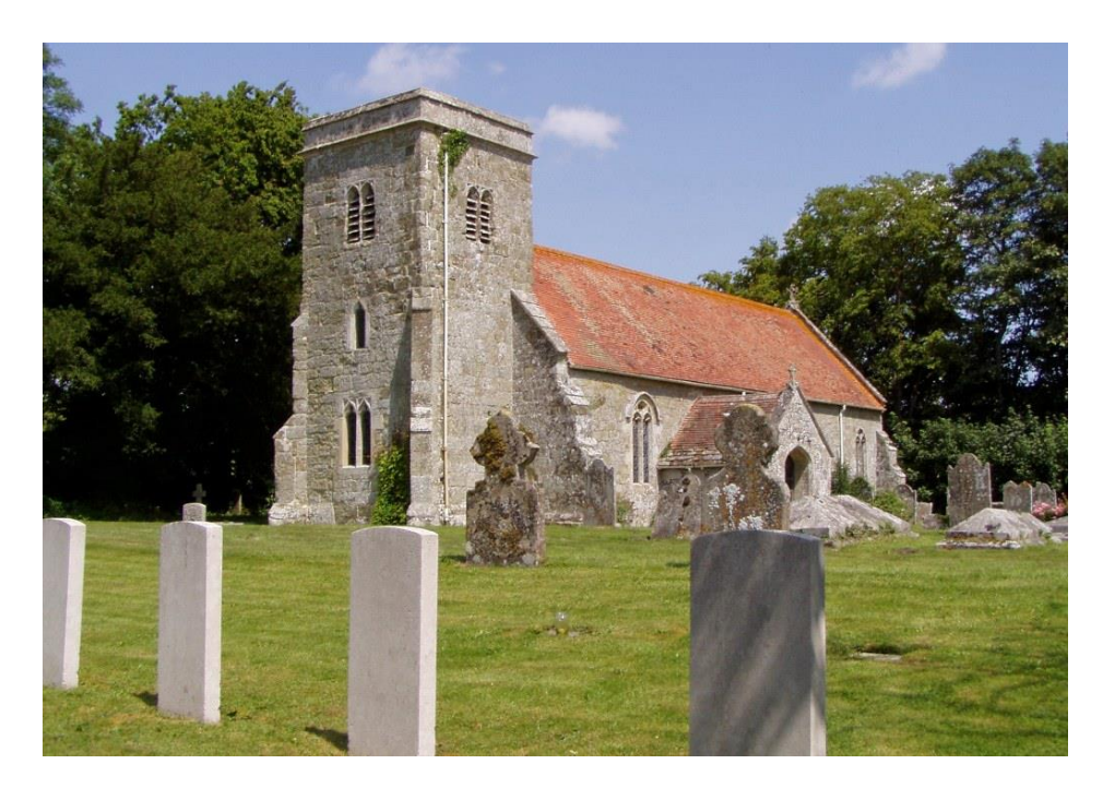
St. Edith's Churchyard, Baverstock, Wiltshire.

He Left His Home, His All, To Serve At His Country's Call Perfect Peace