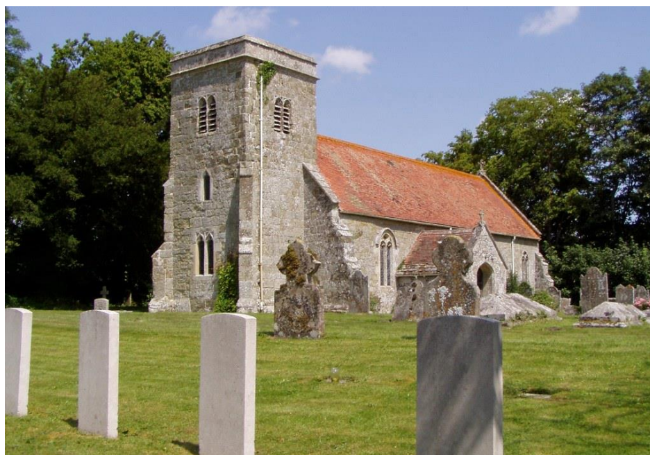
St. Edith's Churchyard, Baverstock, Wiltshire.