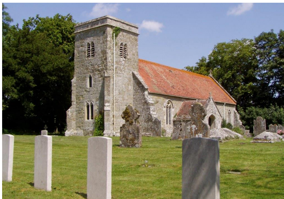
St. Edith's Churchyard, Baverstock, Wiltshire.