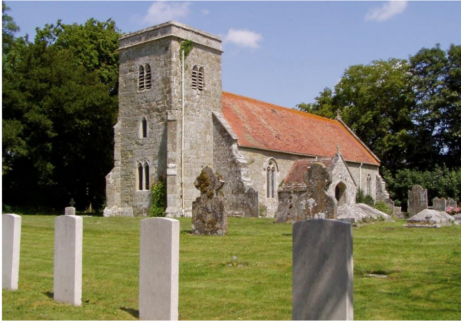
St. Edith's Churchyard, Baverstock, Wiltshire.